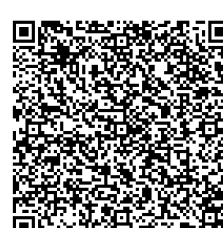
QuickCard Student Login