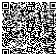
Teacher QuickCard Printing